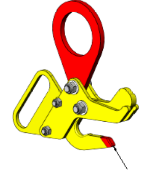
Red painted point

The hook opens automatically when laying down the load and the hook can be pulled of the eye (n° 4 and 5)