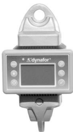
0,5 / 1 / 2 / 3,2 t