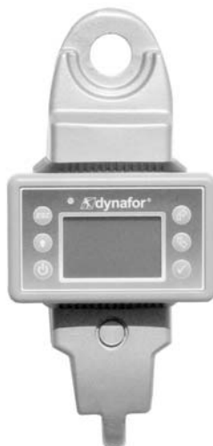
5 / 6,3 t