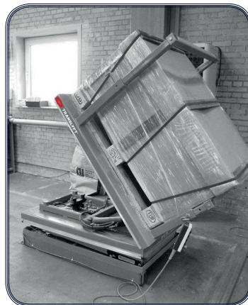
The lifting tables can be equipped with many different options such as tilt.