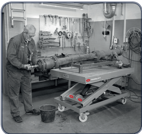
This lifting table offers a flexible solution as it is on castors.