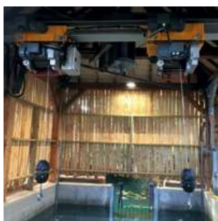
▶ Lifting and translating a load in a zoo.