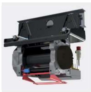
▶ Push trolley model.