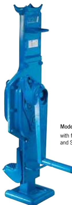
Model STW-F with fixed lifting claw and Sifeku